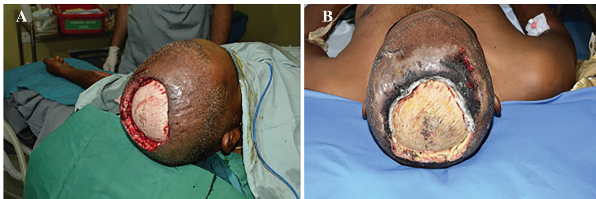
Fig. 2: A) Patient after first debridement. B) Development of fungal infection with fungal hyphae seen in the wound.