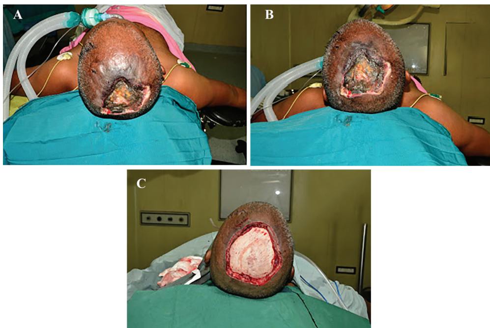
Fig. 1: A) Patient on admission at first debridement. B) Patient on admission at first debridement. C) Patient after first debridement.

On clinical suspicion of invasive fungal infection (zygomycosis), injection of amphotericin B was started and patient was taken for wide debridement. Tissue biopsy was taken and sent for histopathology examination. Outer bony cortex chiseling was done with high speed diamond burr. Histopathology report of specimen came out to be A. corymbifera . Intravenous amphotericin B injection was continued for 4-week period since diagnosis to complete healing. After two weeks of anti-fungal treatment, clinical condition of patient improved. After confirmation of absence of fungal infection, scalp defect was covered with free anterior lateral thigh flap (Figure 3). Recipient vessels were superior temporal artery and vein. In post-operative period, patient was on intravenous amphotericin B injection for 2 weeks. Post-operative period was uneventful (Figure 4A-B).