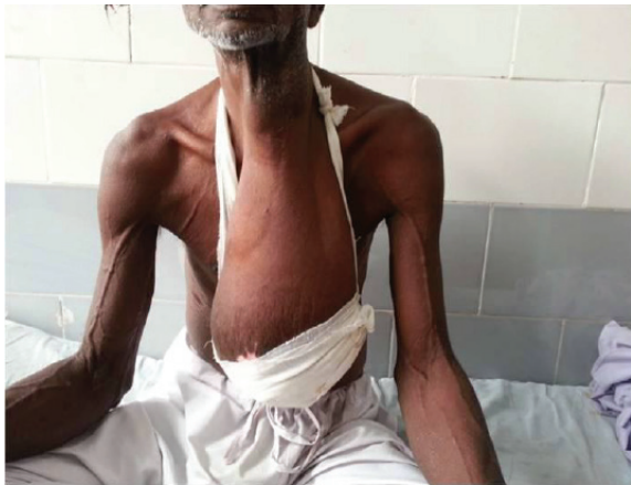
Fig. 1: Clinical photograph of the patient showing huge swelling arising anteriorly from the neck more so on the left side and hanging up to the umbilicus.

palpation, the swelling was smooth, painless and non-tender. Skin over the swelling was stretched, shiny and showed ulceration over the lower most part. There was no lymphadenopathy or any other palpable mass.