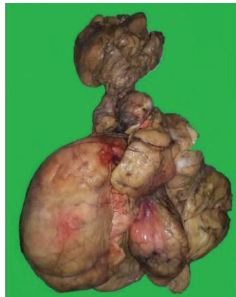
Fig. 3: Gross photograph of the specimen measuring 32 cm in the longest diameter and weighing 2500 grams. Mass is yellow and lobulated in appearance.

On gross examination, excised specimen was yellow in color and lobulated in appearance. It measured 32 cm in the longest diameter and weighed 2500 grams; parts of the thin capsule could be seen over the resected specimen (Figure 3). Overlying skin flap showed ulcerations (Figure 4). Exhaustive sampling of the specimen was done and on microscopy it