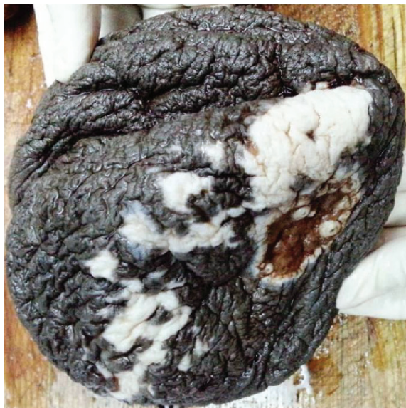
Fig. 4: Gross photograph of the skin flap showing ulcerated surface.

showed capsulated mature adipose tissue with lobular appearance (Figure 5). There was no evidence of malignancy or heterologous element in multiple microsections studied. A final diagnosis of giant anterior neck lipoma with pressure ulcer was made.