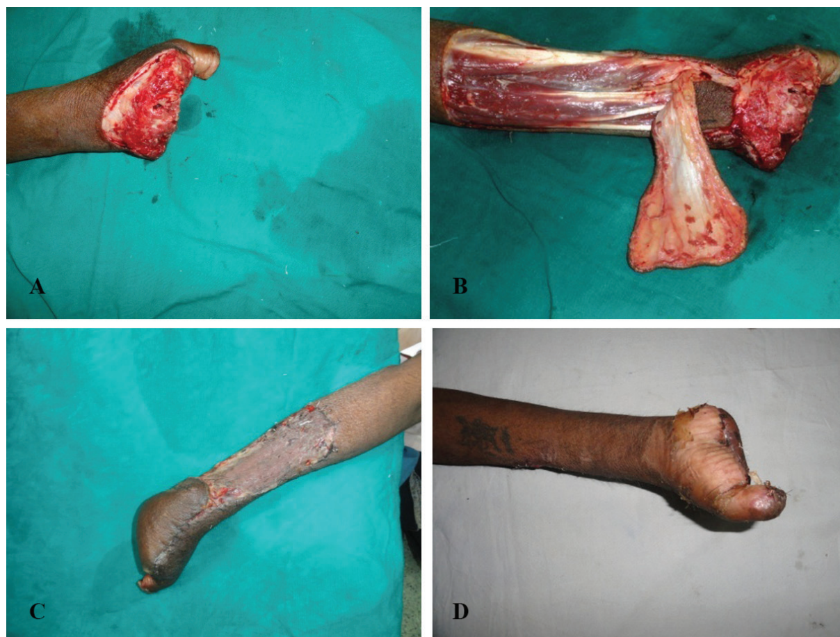
Fig. 4: Anterior interosseus artery perforator flap for amputation stump coverage. A) Post traumatic amputation at the MCP level. B) Harvested anterior interosseus artery perforator flap on the cutaneous perforator of the anterior interosseus artery just proximal to the wrist joint. (Please note absence of posterior interosseus artery on the undersurface of the flap) C) Well settled flap. D) Palmar aspect of the hand showing distal aspect of the flap.

Of the nine patient of trauma, flap was performed in four patients for amputation stump coverage, three patients for dorsum hand coverage, one for proximal palmer resurfacing, and one for distal wrist resurfacing. The defect sizes ranged from 3×4 cm to 6x10cms. The follow up ranged from three weeks to six months. All the donor sites necessitated skin grafting. Of the twelve flaps, there was complete necrosis in one