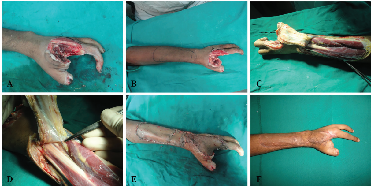
Fig. 5: Anterior interosseus artery perforator flap for dorsum hand coverage. A) Defect with exposed metacarpals. B) Perforator and Flap markings. C) Harvested anterior interosseus artery perforator flap on the cutaneous perforator of the anterior interosseus artery just proximal to the wrist joint. (Please note absence of posterior interosseus artery on the undersurface of the flap) D) Perforator. E) Flap in situ. F) Partial necrosis of flap with secondary healing, and well settled donor site