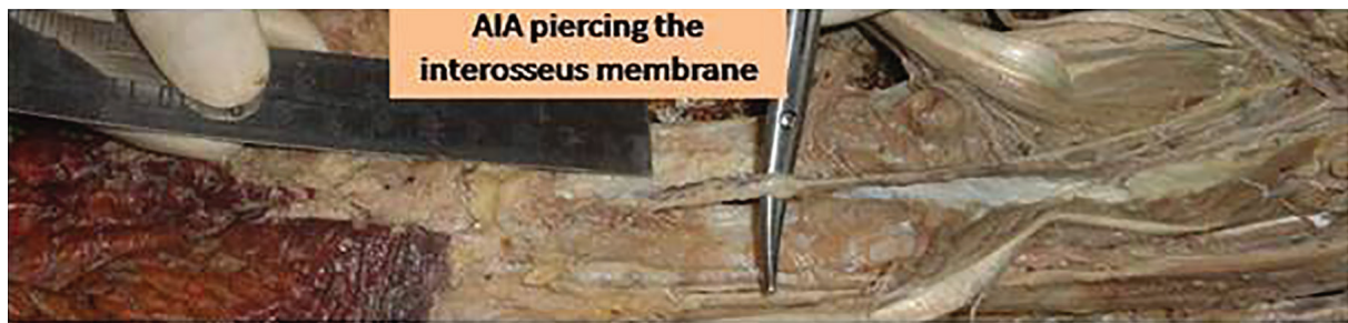
Fig. 3: Anterior interosseus artery perforating the interosseus membrane.

in the group. Extremities with extensive trauma zone and degloving were excluded.