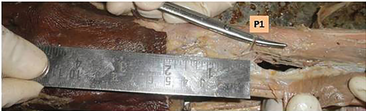
Fig. 6: Anterior interosseus artery perforator at 4cms from the wrist.