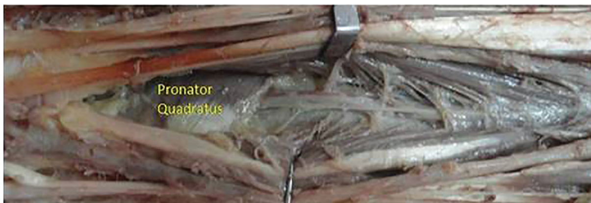
Fig. 2: Anterior interosseus artery and Pronator Quadratus muscle.