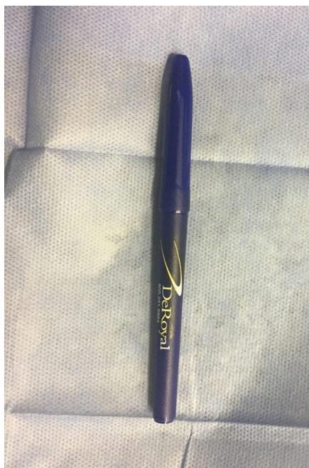
Fig. 1: Intraoperative precise marking done by use of sterile surgical markers.

Body contouring surgery after massive weight loss is becoming very common all over the world and more so in our part of world. The contouring procedures need an extensive preoperative planning and correct marking of the incisions and areas of resection. The marking fades sometimes after scrubbing the patient and use of tumescent fluids. Intraoperative precise marking can be done by use of sterile surgical markers (Figure 1). The scarcity of ink in these markers is frustrating and sometimes we need to open multiple markers, which is not cost effective. Another alternative is to use methylene blue with a Q-tip applicator. The marking by this method is not precise. We have been using Sharpie (Atlanta, Georgia, USA) colored permanent markers in a sterile pouch made from draping sheets. Circulating nurse decontaminates the outer surface of pen with an alcohol