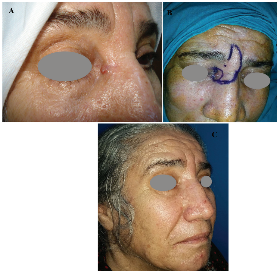
Fig. 1: Sixty-eight years old female patient with BCC on her right medial canthus admitted to our clinic. The defect was reconstructed with procerus flap. (a) Preoperative, (b) Intraoperative, and (c) Postoperative 24 months photos of the patient were presented.

could not find any detailed information about NMSC in our country due to inconsistent data collection. However, BCC/cSCC ratio was 2.1 according to the present study. This result was lower than in the literature that the BCC/cSCC ratio is 3. 10 Moreover, Karadeniz et al. reported the ratio as 1.1 11 and Ülkür et al. found it similar with the literature in their study. 12 Therefore, we think that BCC/cSCC ratio could be different from literature in all around of our country. However, further multicentric studies should be done to evaluate the correct ratios.