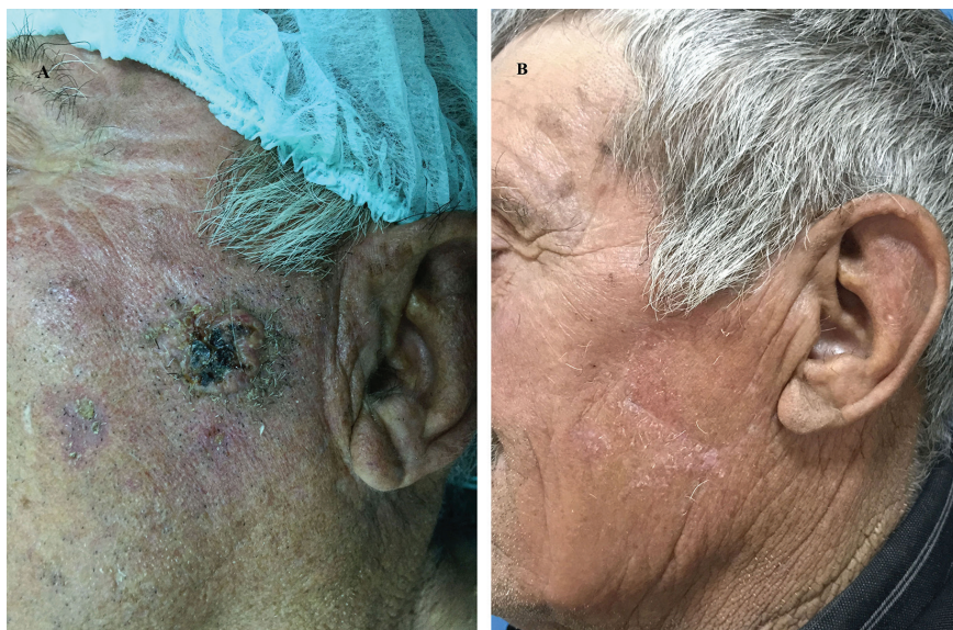
Fig. 3: Eighty-nine years old male patient with cSCC on his left cheek was referred to our clinic. The defect was reconstructed with rhomboid flap. (a) Preoperative, and (b) Postoperative 12 months photos of the patient were presented.