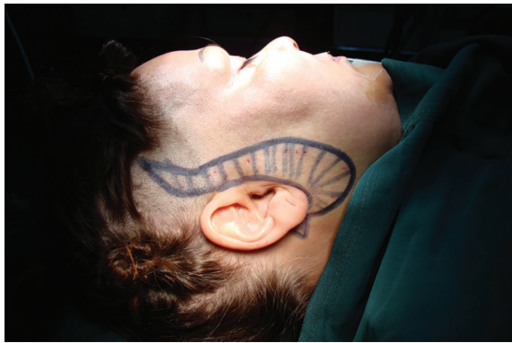
Fig. 2: Preoperational marking for intra-hair line incision, and excision of prefabricated skin.

lidocaine with 25 ml of normal saline/1/100000 epinephrine was injected to each side of the face. Ten minutes after the injection, the procedure was initiated with the excision of the prefabricated skin from the area that had been marked (Figure 1 and 2). Then dissection of malar skin and subcutaneous flap performed under the