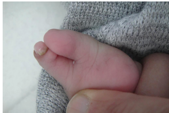
Fig. 3: The ventral aspect of the left hand. The radial digit has dorsal dimelia; manifesting as a well-developed palmar nail and nail fold.