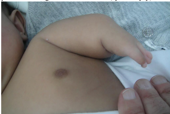
Fig. 1: The short left upper limb. Note that the hand has only two digits.

Radiological examination of the left upper limb showed severe ulnar ray deficiency with radio-humeral synostosis and absent ulna. The hand had two metacarpals and two digital rays (Figure 4). The right lower limb was hypoplastic with three digits in the foot. The preaxial digit was a well-developed big toe. The two postaxial digits were fused (syndactyly) and