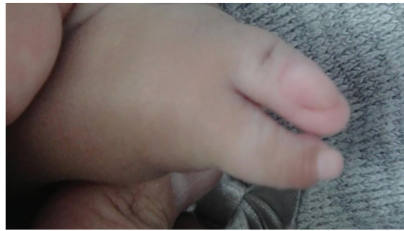
Fig. 2: The dorsal aspect of the left hand. The ulnar digit has ventral dimelia; manifesting as absent nail along with the appearance of an ectopic pulp on the dorsal aspect of the digit.