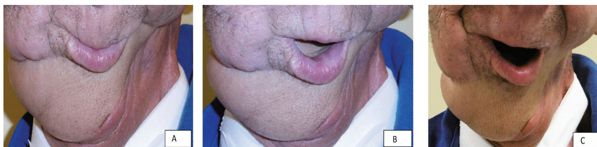
Fig. 3: a, b, c: Clinical results 8 months, postoperatively.

Histopathological evaluation confirmed R0 resection status. On day 11 postoperatively, understandable communication was possible. Mimics and motoric function of the face and remaining mandible were acceptable at time of discharge. After radiochemotherapy, the flap was still viable, no dehiscence of the scars was present. At 2 months postoperatively, the patient was able to communicate understandably without speech canula. Oral nourishment, glutination and swallowing were possible without regurgiation. The patient was seen last in the outpatient clinic 8 months postoperatively. No locoregional recurrence was detected on clinical examination and on MRI scanning. Figure 3 shows the patients clinical examination 8 months postoperatively, closure of the mouth (a), saying the letter 'O' (b) and smiling (c).