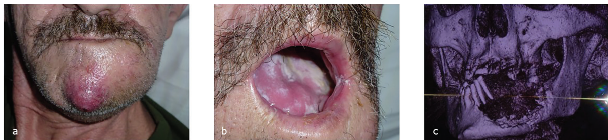
Fig. 1: a, b, c: Clinical appearance and dental CT of the patient.

A supraomohyoidale neck dissection on the right, a radical neck dissection on the left, a 3/4 resection of the tongue, a complete resection of the mouth floor was performed. The lower lip with its orbicular muscle could be preserved. Soft tissue defect size was 351 cm 2 . An ALTP flap from the left thigh sized 28x14 cm was harvested. Primary closure of the defect was possible. Left external carotid artery and vein were used for end- to side anastomosis. The flap