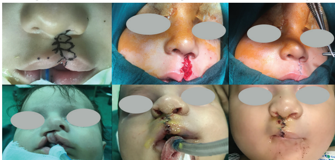
Fig. 3: A: Multiple Y to V flap design, B: tension apply in the wet-dry junction suture about 1-2 mm in overcorrected position versus the non-cleft philtral side, C: Final closure. (Case 1). D: wide unilateral cleft lip and palate (pre op), E: correction the position of the lip and nose, F: Final closure (Case 2).

Then the tail of separated Y was cut on the cleft side philtrum just in front of the Y head. Depending on the severity of the unilateral cleft lip, depth of the Y head, Y tail was cut on the philtral side. We avoided extending the incision