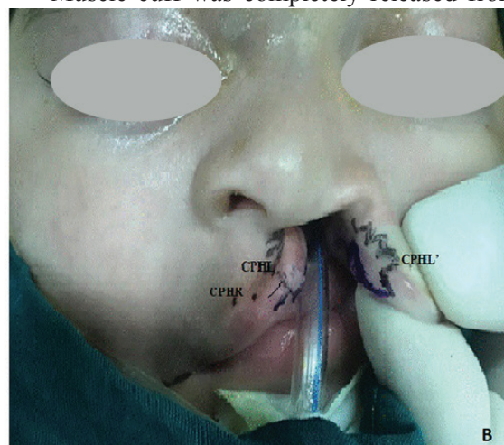
Fig. 1: A: Schematic view of operation, B: Design and lip markings, (Noordhoft's points). SBAR: Sub-Alar-Right. SBAL: Sub- Alar- Left. CPHR: Crista Philtri – Right .CPHL: Crista- Philtri –Left. CPHL': Crista - Philtri -Left (cleft side).