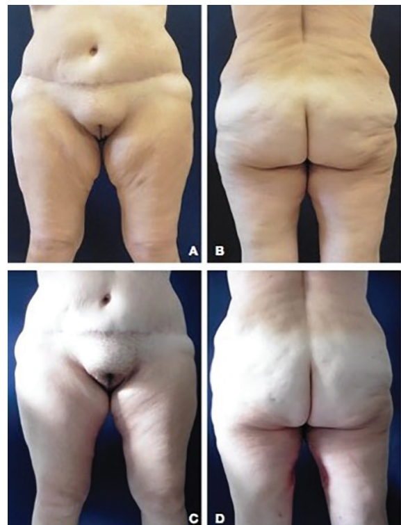
Fig. 4: (A-B) Anterior and posteriorview of this 52-year-old woman who underwent Liposuction Assisted Medial Thigh Lift after gastric bypass and weight loss of 50 kg. (C-D) Three months postoperatively. Note the location and the quality of the scar.