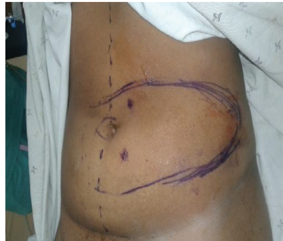
Fig. 1: Two perforators identified about 3 cm from the umbilicus at the base of the flap.

The flap was fashioned around the perforators after determining the length and width based on the size of the defect to be closed (Figure 2). The flap was raised from the distal to the proximal end in the subfascial plane until the perforators were reached (Figure 3). The flap was then