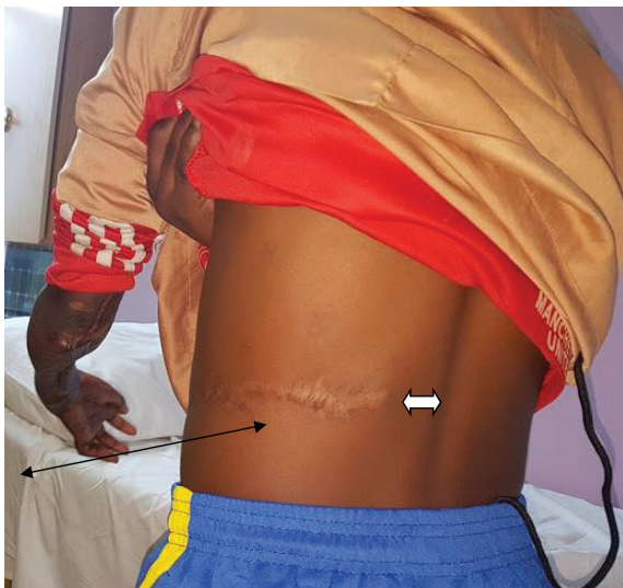
Fig. 6: Note the scar on one of the patients who had paraumbilical perforator flaps. The flap extended to just about 4 cm from the spinal cord.

RTA: Road traffic accidents, M: Male, F: Female