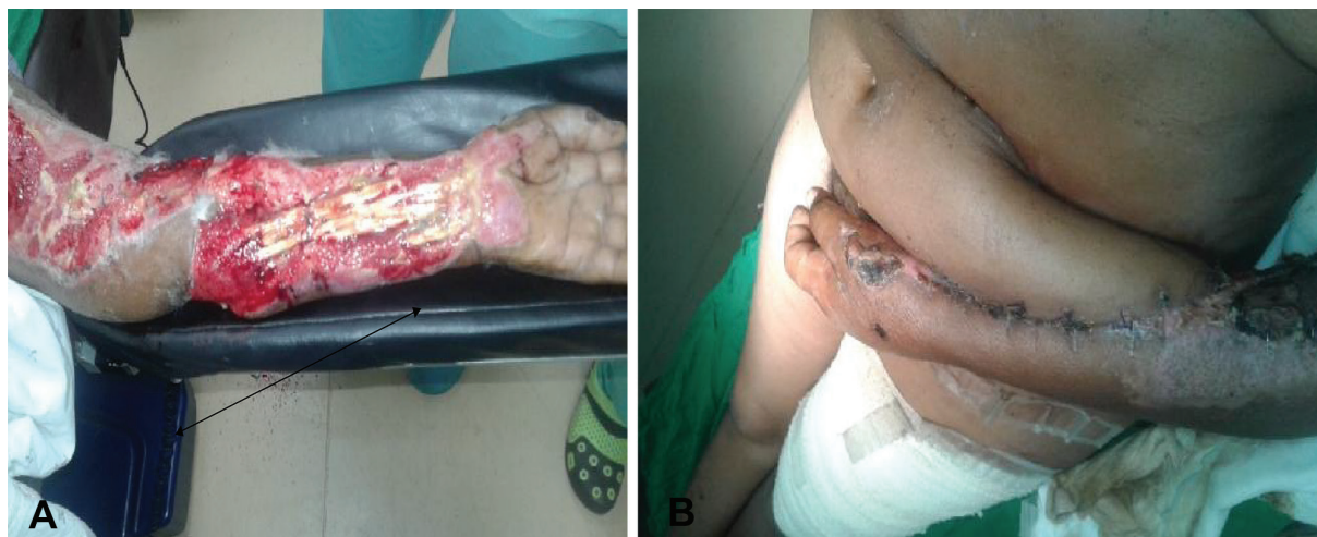
Fig. 4: A. Patients with exposed tendons and neurovascular structures ready to be covered with paraumbilical flap of dimensions 24×10 cm. B. Perforator paraumbilical flap successfully anchored to the recipient site.