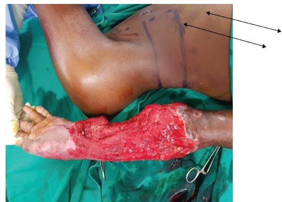
Fig. 2: Patient with extensive arm defect that required free nerve grafts to reconstruct both the median and ulnar nerve with two perforators of paraumbilical flap planned to cover the wounds. The flap dimensions were determined by the size of the wound to be covered. Note the two perforators marked by arrows.