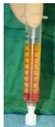
Fig. 1: Harvested fat after centrifugation: 1) Upper part: Oil from damages adipocytes, 2) Middle part: Purified fat, and 3) Lowest part: Red cells, cell's debris and liquids.

The ideal method for fat purification would separate blood, infiltration fluid, and cell debris from healthy adipocytes with minimal trauma (Figure 1). This particular step is the most debated part of the fat grafting procedure, subjected to intense scrutiny without, however, a definitive solution. While various methods for separating out fat have been described, none has been determined to be superior to the others, but it is accepted that techniques involving less manipulation may have better outcomes including (i) Sedimentation: Aspirate material stands for 30 minutes to 1 hour, which separates it into its various components; 41 (ii) Washing: aspirate fat is washed with 5% glucose solution, 0.9% normal saline, or sterile water; 42 (iii) Filtration: Harvested fat is placed on sterile gauze over sterile cup, washed with ringer's lactate and dried before loading into syringes; 43 (iv) Centrifugation: Harvested fat is centrifuged 3 minutes at 3000 rpm. This method separates fat from substances that increase degradation, and concentrates adipocytes and stem cells per milliliter of fat transplanted. 44 It is the most rapid and clean method.