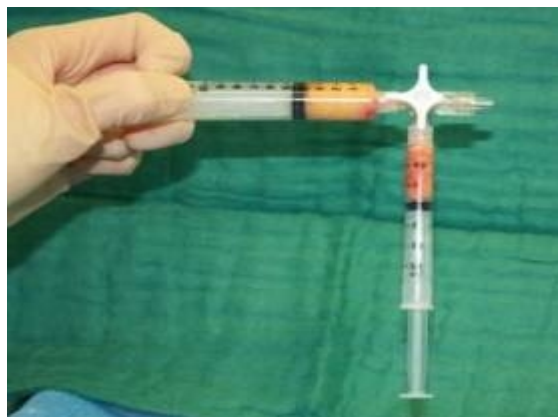
Fig. 3: Purified fat transfer from 10 ml Luer Lock® syringe to a 1 ml Luer Lock® syringe through a 3-ways connector.