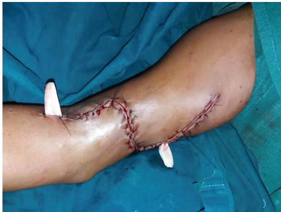
Fig. 3: Suture line post-residual tumor excision and brachial artery reconstruction.