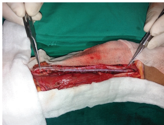
Fig. 2: The great saphenous vein graft (in-between the jeweler forceps).