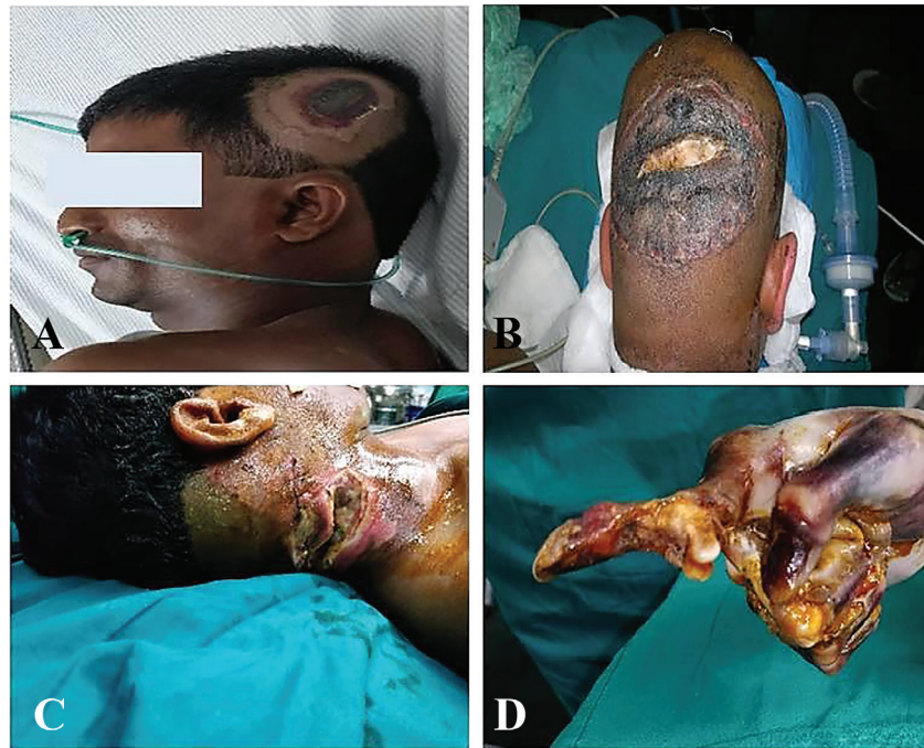
Fig. 1: A: Scalp entry wound. B: Scalp entry wound with deep calvarial necrosis. C: Neck entry wound. D: Debrided finger high voltage electrical injury.