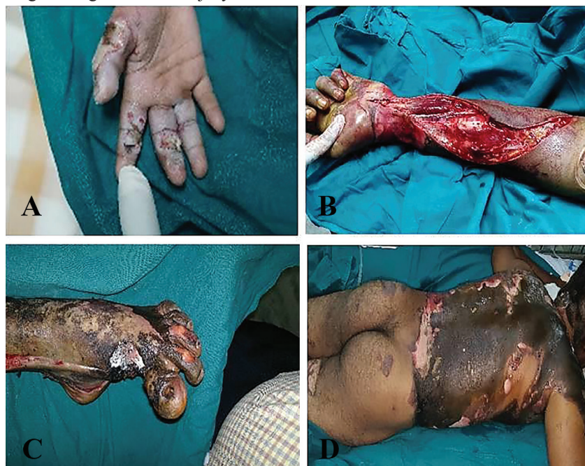
Fig. 2: A: Low voltage electrical injury to finger. B: Decompression fasciotomy for forearm. C: High voltage electrical injury D: Electrical flash burns injury to the back.

methyl methacrylate (PMMA) bone cement. Skin allografting was performed in 2 (2.5%) patients following wound debridement when extensive areas were involved due to flash burns (Table 3).