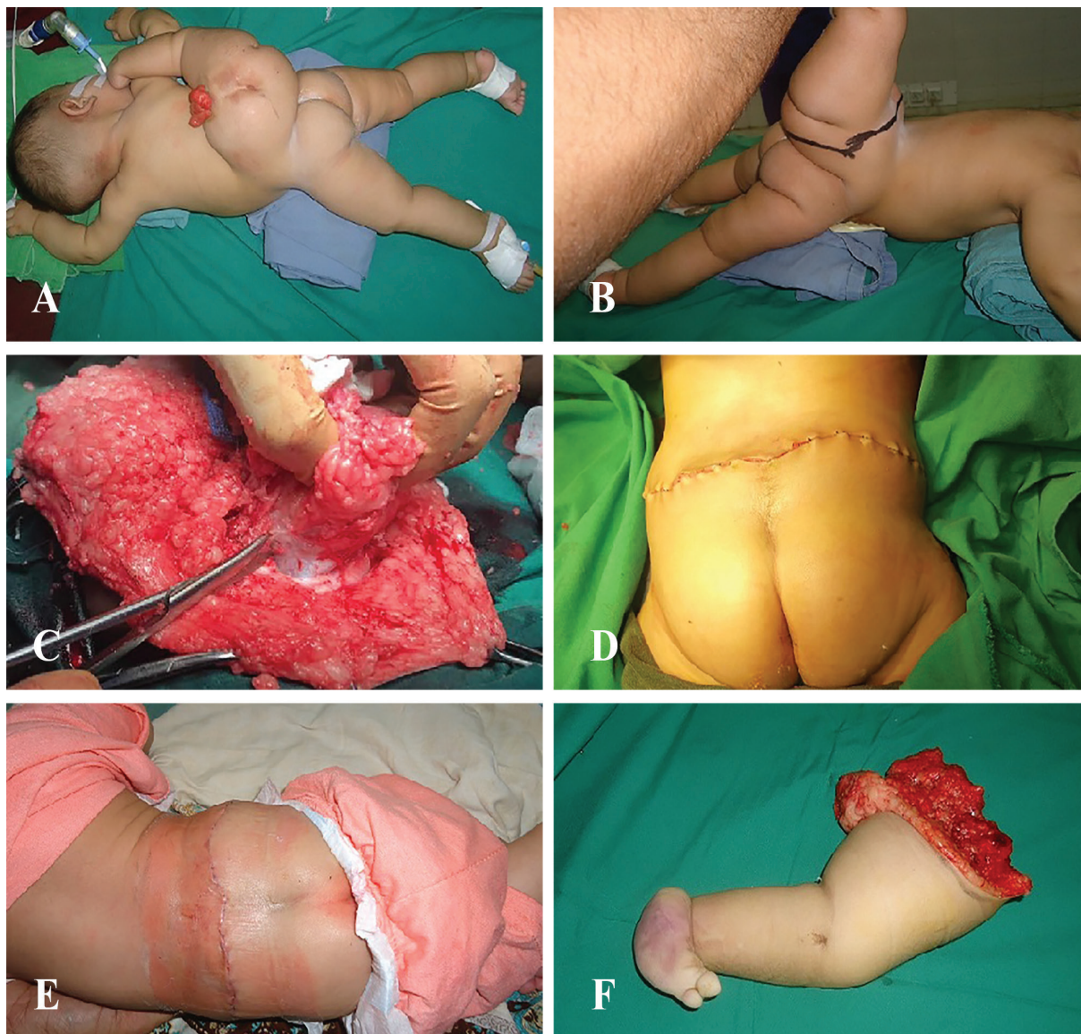
Fig. 3: A: The infant was positioned prone on the operating room table for undertaking surgery. B: An elliptical skin incision with transverse orientation was designed to ensure adequate closure of the resultant defect after limb extirpation. C: The neural placard was carefully dissected, de-tethered from attachments and returned. Dural closure was performed. The overlying dorsolumbar fascia was closed. D: The skin was closed with subcuticular absorbable sutures. Steristrips were applied to support the wound. E: The wound was perfectly fine on the first dressing change on 5 th postoperative day, after removal of steristrips. F: The ablated accessory limb.