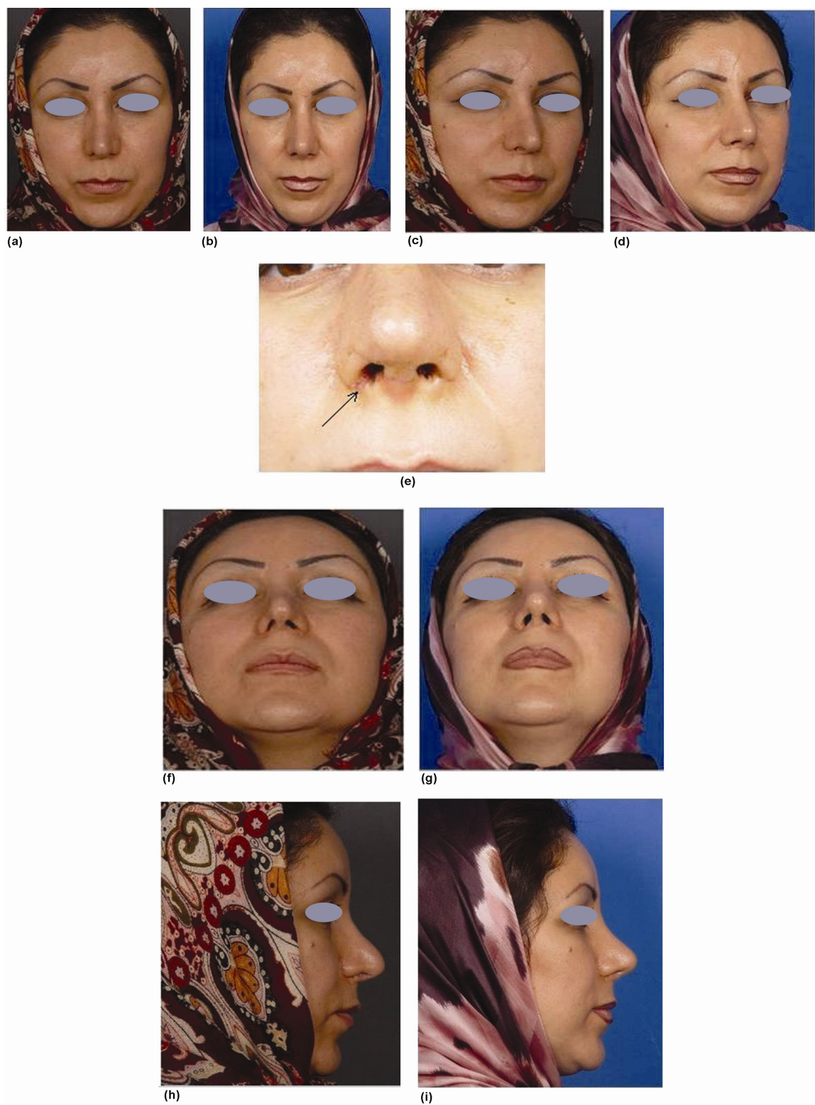
Fig. 3: A lady who complained of asymmetric nostrils and other deformities following rhinoplasty. Images (a) and (b) show her on frontal view, before and after tertiary rhinoplasty and surgical correction with small composite grafts on the right alar rim, respectively. Figures (c) and (d) show the same patient, on three-quarters view. Figure (e) shows a close-up view of the same patient 10 days after surgery. The site of graft is indicated by an arrow. Figures (f) and (g) show basal view (h) and (i) show profile view.