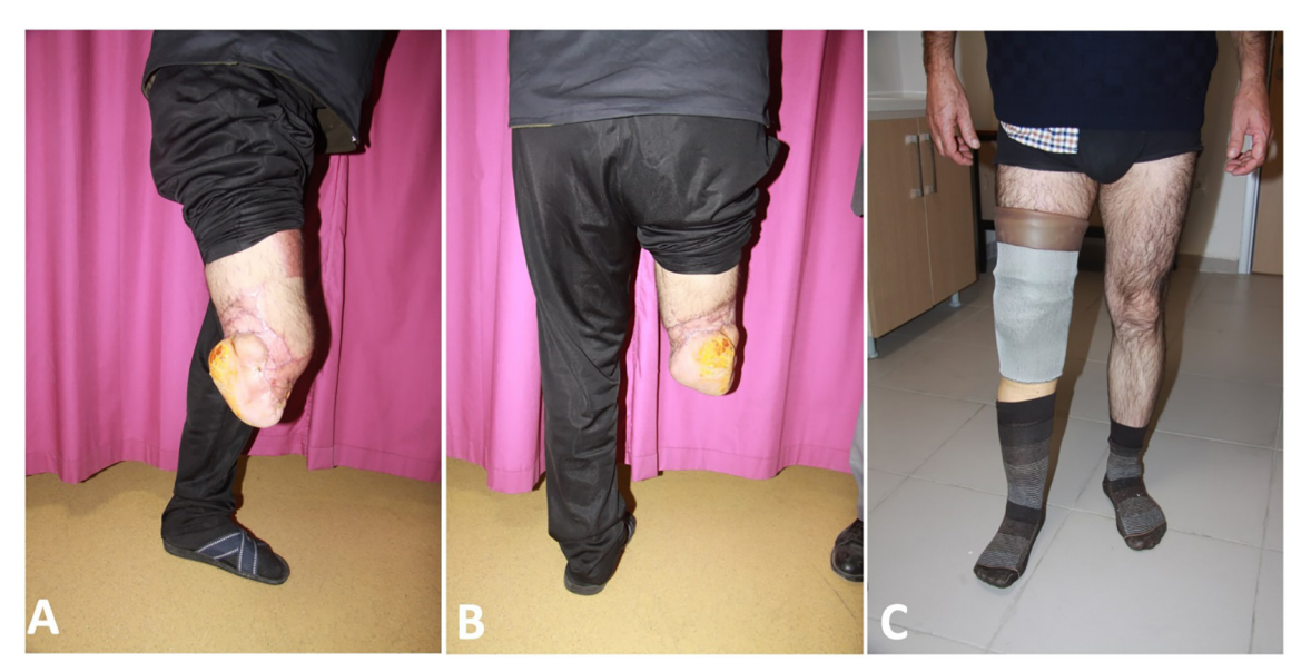
Fig. 3: A. Lateral view of the reconstructed below knee stump. B. Posterior view of the reconstructed below knee stump. C. Standing position of the patient with prosthesis.

extremity is a serious challenge for a surgeon in terms of medical ethics.<sup>4-5</sup> Therefore, some criteria have been reported in the literature for standardization of amputation decision. "The Mangled Extremity Severity Score" reported by Johansen et al. is one of them. According to this score, severity of the injury (Low – Very high energy: 1-4), limb ischemia (Pulse reduction - Cold, paralytic, 6 hours past: 1-3), shock (Systemic blood pressure ≥9 mmHg: 0 -persistent hypotension: 2) and age (under 30 years - 50 years and older: 0-2) parameters were scored. Direct amputation was recommended, if this score was 7 or more.<sup>5</sup>