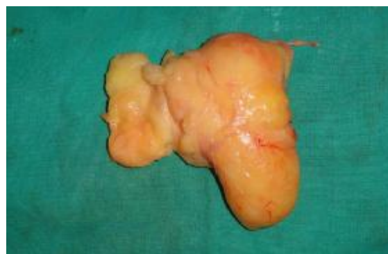
Fig. 4: Resected lipoma on the table.

Grossly, the mass was yellowish in color, lipomatous and multilobulated. The mass was gradually dissected (Figure 4). It extended from interosseous membrane on volar side to the interosseous membrane on the dorsal side encasing the entire distal ulna. As the ulnar neurovascular pedicle was at some distance from the mass and appeared largely uninvolved, no further exploration or neurolysis was considered.