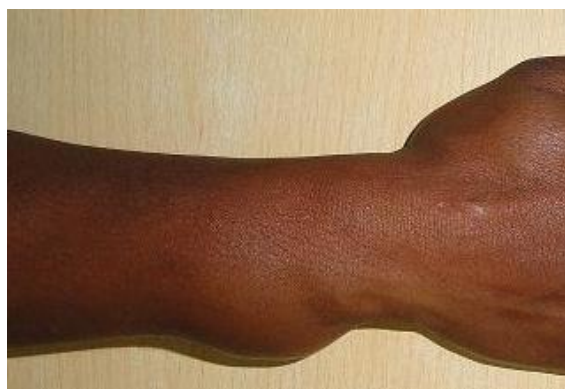
Fig. 1: Gross appearance of bulged tumor.

numbness at palmar aspect of fingertips in the ulnar nerve territory of the right hand since the past four months. She also complained of an asymmetric progressive swelling of her right distal forearm since the past two years. Physical examination revealed a soft tissue swelling localized to the ulnar border of the distal forearm extending volarwards and dorsally. The mass was non-tender and did not transilluminate. The grip strength, adduction and abduction and range of motion were symmetrical in both the hands (Figure 1).