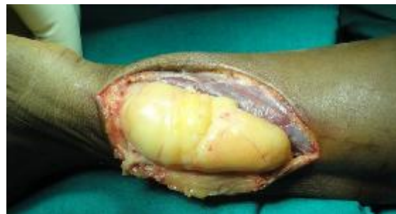
Fig. 3: Lipomatous appearance of the tumor.

block with tourniquet control. Longitudinal incision was made on the ulnar border of the distal forearm. The FCU was stretched, and displaced outwards. On reflecting the FCU, the mass was exposed (Figure 3).