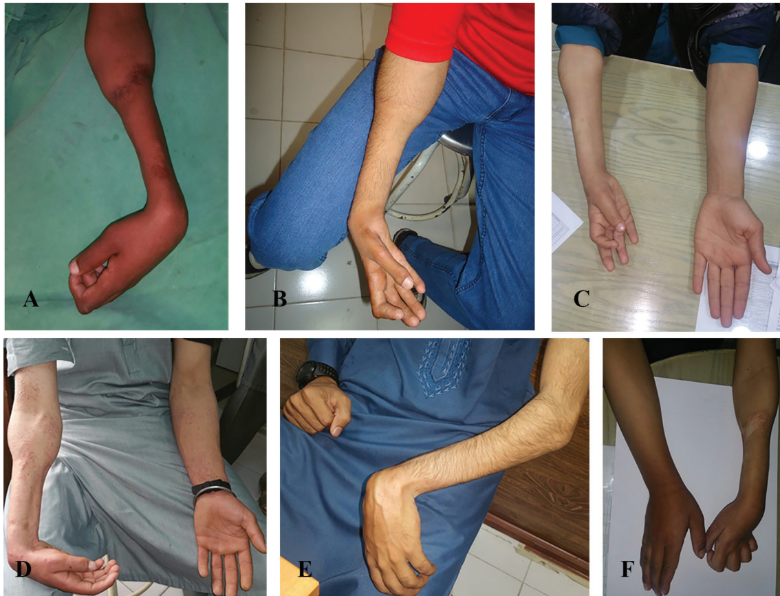
Fig. 2: A: The left forearm of a 16 years boy with severe VIC showing the characteristic demarcation with normal muscle bulk in the proximal one third and circumferential atrophy involving distal two-thirds of the forearm. There is flexion contracture of the wrist. B: The right forearm of a 19 years adolescent male with severe VIC showing the circumferential atrophy of distal two-thirds of forearm. Flexion contractures of the fingers and wrist are visible. C: The right forearm of 17 years old boy who had sustained primary ischemic insult seven years ago. Remarkably there is global atrophy and shortening of the forearm and hand as compared to the contralateral normal side. D: The right forearm of a 20 years male with VIC of moderate severity. Flexion contracture of the wrist is appreciable. E: The left sided VIC in a 25 years old man with fixed flexion contracture of the wrist. F: Severe VIC involving the left forearm of 19 years adolescent. There is clawing because of the associated impaired median and ulnar nerves.