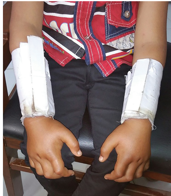
Fig. 1: This photograph demonstrates the typical method employed by traditional bone setters. They fix the fractures initially with brutal manipulation to reduce it, followed by putting bamboo sticks around the distal two-thirds of the forearm. These sticks are then surrounded by tight constricting bandages. The proximal one third of the forearm is characteristically spared. Swelling of the hands can be appreciated.

The underlying causes of the initial traumatic insults included application of tight bandages by traditional bone setters for fixing forearm fractures ( n=31 ; 83.78%), high voltage electric burns involving hands/forearms ( n=5 ; 13.51%) and supracondylar fracture with vascular compromise ( n=1 ; 2.70%). The time interval