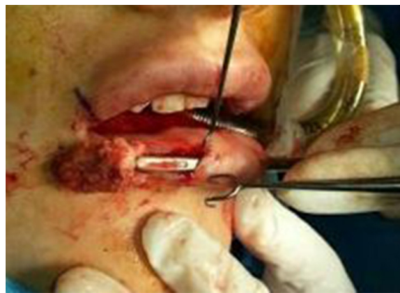
Fig. 4: The graft was placed into the prepared tunnel.

The upper and lower lips projection and height were measured before and 6 months after grafting by using Adobe Photoshop 5.0 (Adobe System, Inc., San Jose, CA) and were compared with appropriate statistical analysis using SPSS software (Version 11.5, SPSS Inc., Chicago, IL, USA). Paired sample tests were used for comparison and a p value less than 0.05 was considered statistically significant.