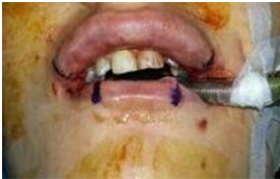
Fig. 2: Lower lip marking before augmentation.

4 mm medial to the each oral commissures on the mucosal surface (Figure 2).