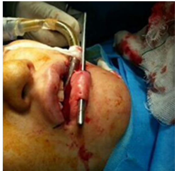
Fig. 3: Insertion of cannula at the lower lip.

All patients received oral antibiotics 1 hour before the procedure and for 2 days post-operation. Depending on patients' skin type, usually 4 days post-operation, the sutures were removed. The patients were informed that their lips would appear overly corrected because of postoperative swelling in early postoperative period. This swelling subsided gradually to achieve the accepted size and shape. For each patient, a standard digital photo was used for the analysis in lips. The frontal view was used to measure the height of the upper lip and the lower lip (in mm) in the middle of the cupid's bow. The lip projection was measured on a lateral view as point of maximum protrusion of the vermillion (in mm), perpendicular from a vertical line connecting the base of the columella and to the fold demarcating lower lip and chin. The photographs were taken pre-operatively and 6 months post-operatively (Figure 5).