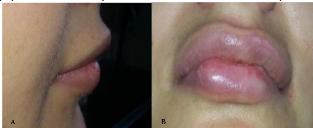
Fig. 6: (A): Lateral view show lip edema 10 days after surgery. (B): Frontal view.

In the first technique, the incision is made along the whole lip border circumferentially; while in the second, the sub-nasal sill is incised. In these two techniques, it is possible