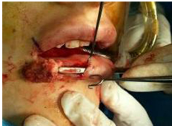
Fig. 4: The graft was placed into the prepared tunnel.

The upper and lower lips projection and height were measured before and 6 months after grafting by using Adobe Photoshop 5.0 (Adobe System, Inc., San Jose, CA) and were compared with appropriate statistical analysis using SPSS software (Version 11.5, SPSS Inc., Chicago, IL, USA). Paired sample tests were used for comparison and a p value less than 0.05 was considered statistically significant.