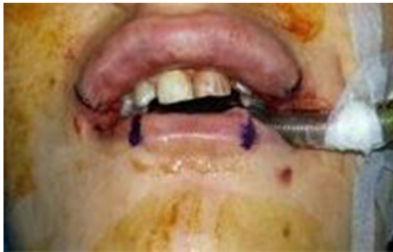
Fig. 2: Lower lip marking before augmentation.

4 mm medial to the each oral commissures on the mucosal surface (Figure 2).