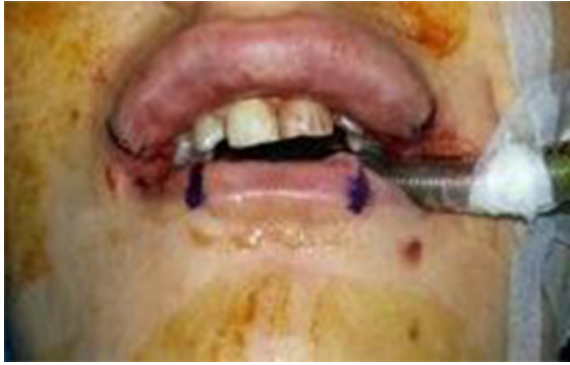
Fig. 2: Lower lip marking before augmentation.

4 mm medial to the each oral commissures on the mucosal surface (Figure 2).