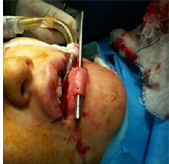
Fig. 3: Insertion of cannula at the lower lip.

All patients received oral antibiotics 1 hour before the procedure and for 2 days post-operation. Depending on patients' skin type, usually 4 days post-operation, the sutures were removed. The patients were informed that their lips would appear overly corrected because of postoperative swelling in early postoperative period. This swelling subsided gradually to achieve the accepted size and shape. For each patient, a standard digital photo was used for the analysis in lips. The frontal view was used to measure the height of the upper lip and the lower lip (in mm) in the middle of the cupid's bow. The lip projection was measured on a lateral view as point of maximum protrusion of the vermilion (in mm), perpendicular from a vertical line connecting the base of the columella and to the fold demarcating lower lip and chin. The photographs were taken pre-operatively and 6 months post-operatively (Figure 5).