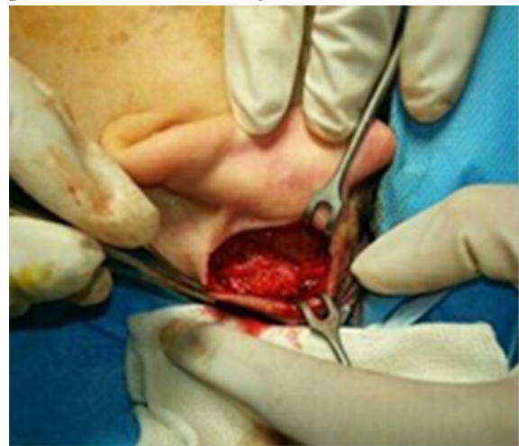
Fig. 1: Harvesting fibroareolar tissue from post-auricular region.

The exclusion criteria included any previous lip augmentation via injectable and/or surgical fillers in the lips, perioral skin resurfacing and any history of esthetic procedures of the nose, jaws, or anterior teeth. All surgeries were performed by a single surgeon. The graft was harvested from the post auricular loose fibro areolar tissue via post auricular approach. After intravenous sedation or general anesthesia, local anesthesia was accomplished through 5 mL of 2% lidocaine and 1:100,000 epinephrine. then a C-shape incision was made by the number 15 scalpel blade in the postauricular sulcus (Figure 1).