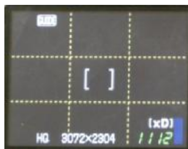
Fig. 1: The commonest four axes grid leaves focus point without reference lines.

The authoritative Institute of Medical Illustrator 3 published its guidelines about "Rhinoplasty and Septorhinoplasty Photography": One of the most important concerns is about the use of standard viewfinder alignment grids to help finding both horizontal (Frankfurt and Reid planes first) and vertical reference planes during shooting. However, some cameras lack this grid at all and some other have grid with only four axes leaving focus point without reference lines. (Figure 1)