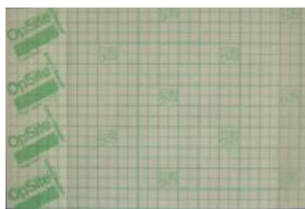
Fig. 2: Opsite Flexigrid™ 10x12 Cm.

We thought about a new application of Opsite Flexigrid™ (Smith and Nephew Medical Limited, Hull, HU3 2BN, England) which is a transparent, adhesive film dressing, with a measurement grid (Figure 2).