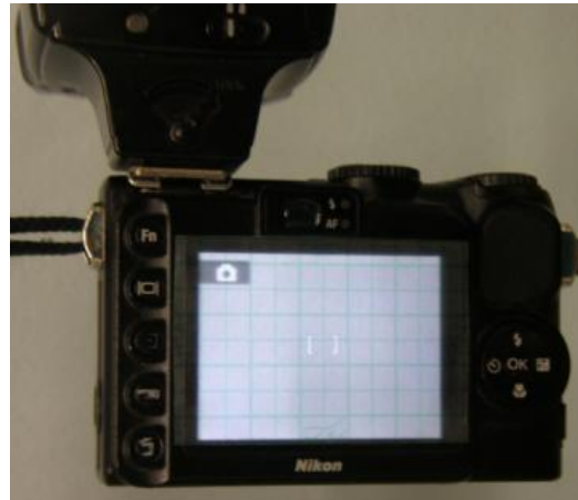
Fig. 5: Grid is positioned on camera screen.

The grid did not alter subject visibility and allowed the alignment of facial landmarks 4 in all conventional rhinoplasty pictures. This is a cheap (0.82 euro for 6x7 Cm sample, 2.04 for 10x12 Cm sample), quick and reversible way to mechanically add to digital camera a frequent lacking display option.