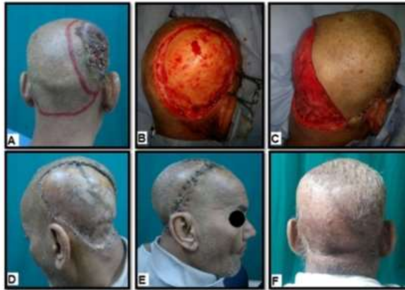
Fig. 2: A 58-year old male with BCC in the right temporo-parietal area. A) Pre-operative marking of the flap and the adequate margins of the tumor. B) Intra-operative view after the lesion was excised; the size of the defect was 154 cm 2 . C) Intra-operative view shows flap harvesting and inseting. D, E) Postoperative view shows covering of the secondary defect by STSG and complete survival of the flap. F) Six months postoperative view shows good functional and esthetic outcome.