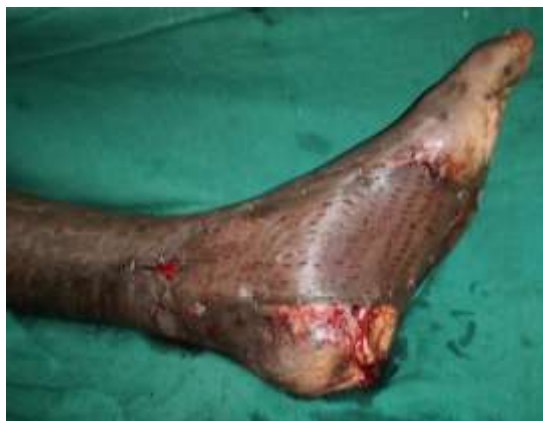
Fig. 3c: Flap covered with split-thickness skin graft