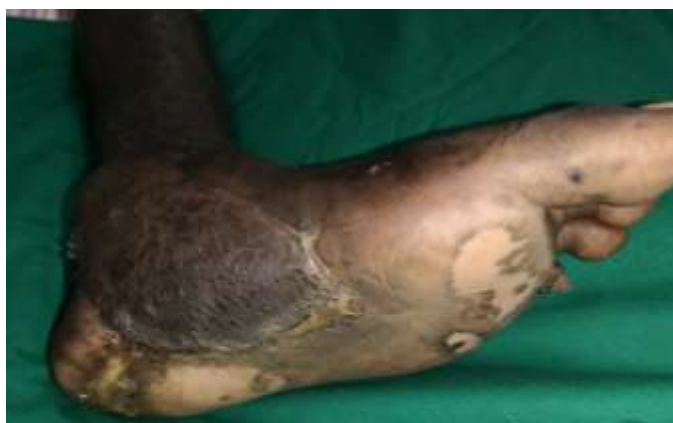
Fig. 3e: After 4 months follow up well-settled flap