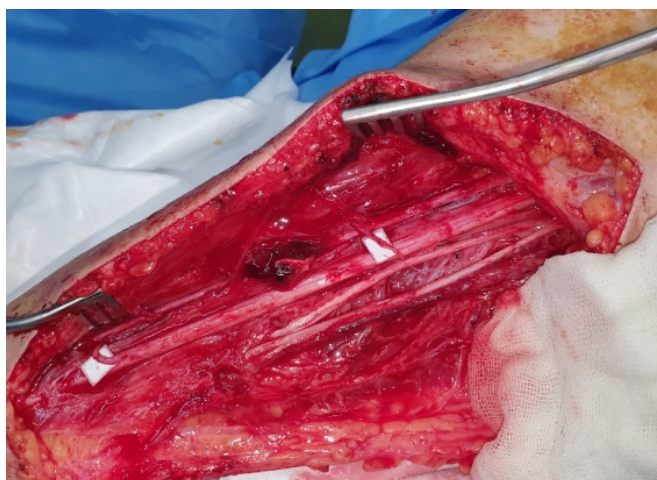
Fig. 1: First surgery in supine position.

Surgery scene as demonstrated by white backgrounds nerve fascicles transferred from the ulnar nerve to the biceps brachii of the musculocutaneous nerve and from the median nerve to the brachialis branch of the musculocutaneous nerve.