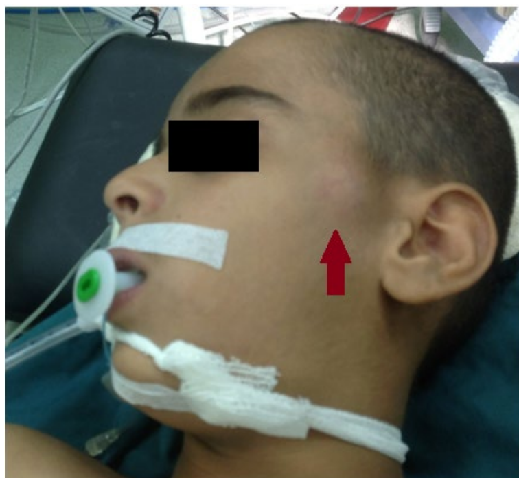
Fig. 1: A 10-year-old boy with a mass on the left periauricular region