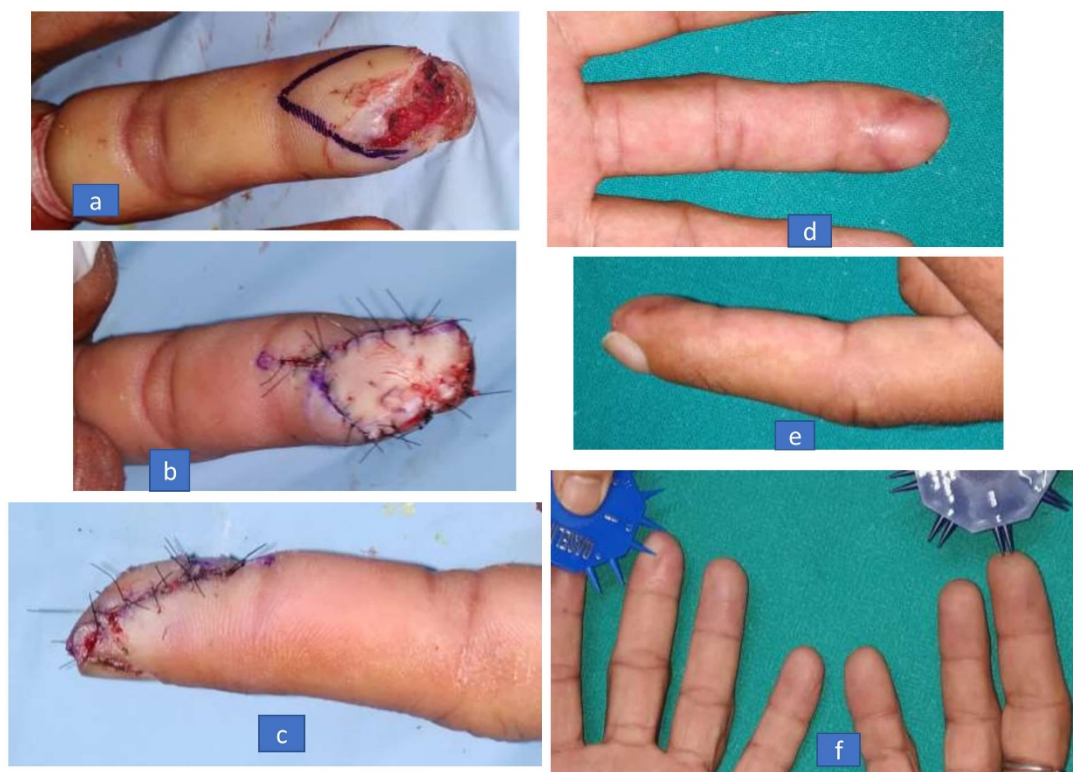
Fig. 3: Fingertip reconstruction with Atasoy flap (a)Allen II amputation (b-e) volar & lateral views of immediate post-operative and 9 months follow up of reconstructed fingertip (f) comparison of 2PD of reconstructed with contralateral fingertip