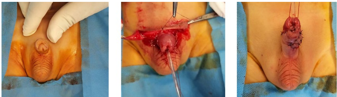
Fig. 2: Modify meatal advancement glandular with release chordi for hypospadias repairin