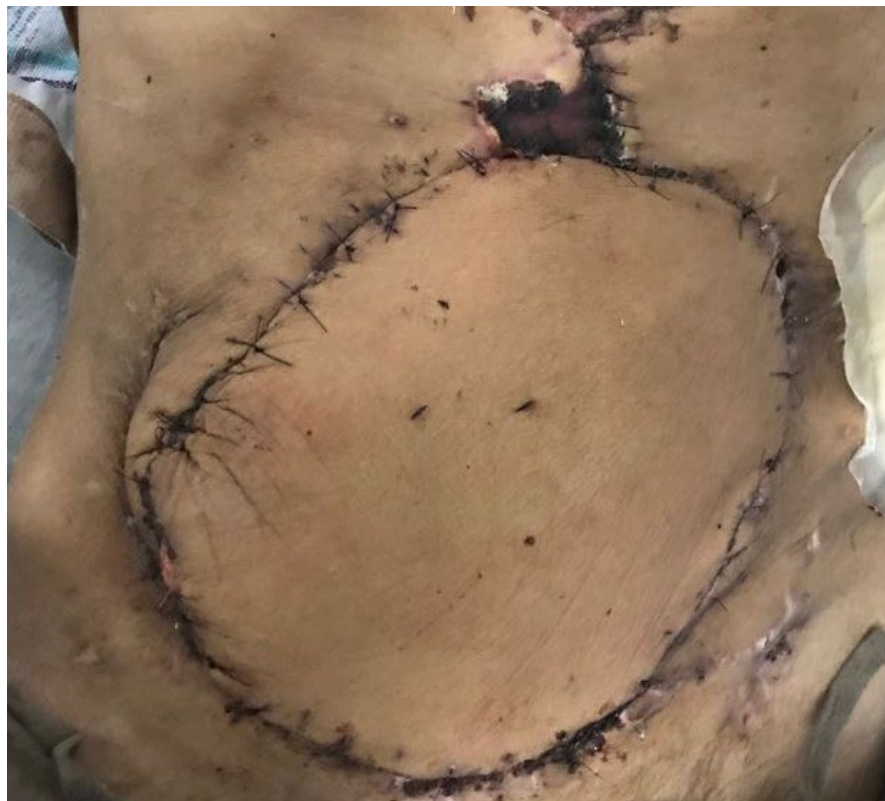
Figure 8: Post operative picture