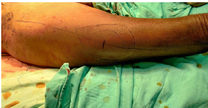
Figure 2: Markings of pedicled ALT flap