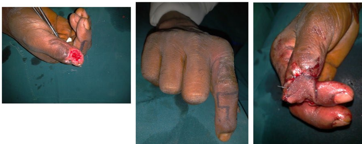
Figure 2: Fingertip injury of the thumb, flag flap harvested from the index finger based distally on the DIP. The patient had lost a cross finger flap from the proximal phalanx before the procedure.