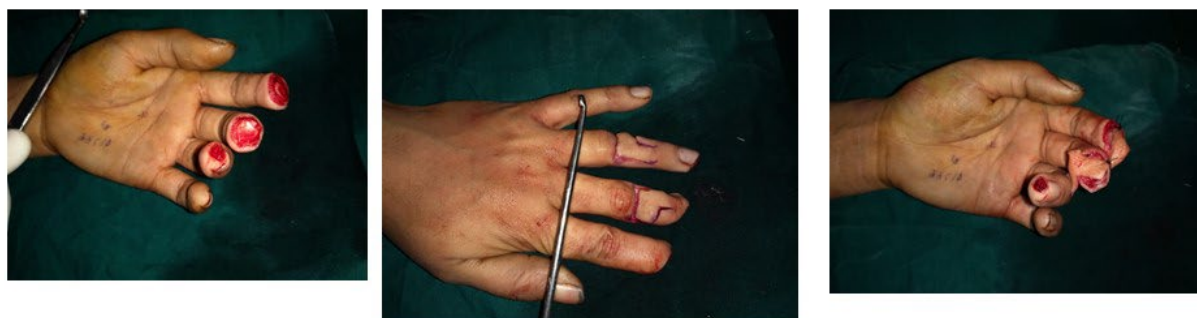
Figure 4: Hetero-digital Flag flap was used to cover index and middle finger tips.

and aesthetic result. The flag flaps are dorsal skin flaps that do not give an aesthetic result as good as the palmar flaps.