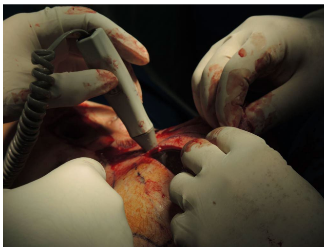
Figure 4: Finding feeding arteries on pedicles by transillumination

in the midline on the frontal bone was fixed as a cantilever graft. The tip of the nose was reshaped with cartilage grafts as well. To create an arc of the alae, cartilage was fixed between flaps. Subsequently, the cartilage harvested from the rib which was placed as a columella between the dorsum and maxilla was sutured by nylon 5.0 to reproduce the final shape of the nose. On both sides, the new cartilaginous septum was covered with the de-epithelialized skin flap. A frontal flap was used for the mucous layer and the other one was applied as the outer cutaneous layer. The flap was sutured all around and infolded at the site of the alae. The donor area of the frontal flap was closed completely by primary approximation