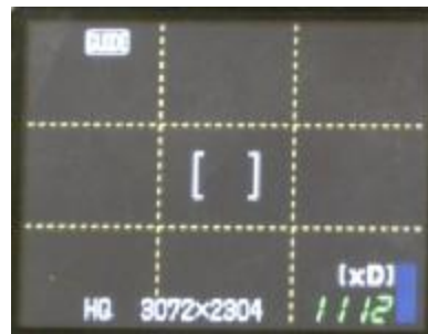
Fig. 1: The commonest four axes grid leaves focus point without reference lines.

The authoritative Institute of Medical Illustrator 3 published its guidelines about “Rhinoplasty and Septorhinoplasty Photography”: One of the most important concerns is about the use of standard viewfinder alignment grids to help finding both horizontal (Frankfurt and Reid planes first) and vertical reference planes during shooting. However, some cameras lack this grid at all and some other have grid with only four axes leaving focus point without reference lines. (Figure 1)