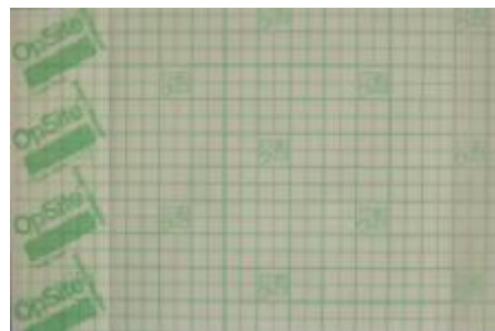
Fig. 2: Opsite Flexigrid™ 10x12 Cm.

We thought about a new application of Opsite Flexigrid™ (Smith and Nephew Medical Limited, Hull, HU3 2BN, England) which is a transparent, adhesive film dressing, with a measurement grid (Figure 2).