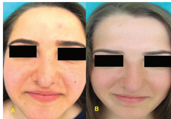
Fig. 3: A and B: Nasal septal deviation angles.

found in the literature associated with similarities of the nasal deformities: Howie 5 described the genetic similarity of a nasal septum deviation in monozygotic twins, Chaiyasate et al. 6 could not demonstrate a significant difference between the twins with regard to septal deformity.