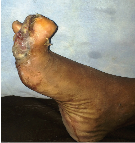
Fig. 1: Ulceroproliferative lesion of the left great toe.