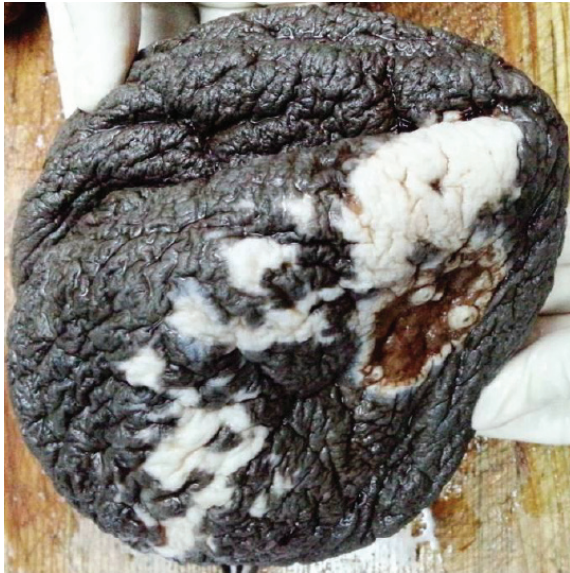
Fig. 4: Gross photograph of the skin flap showing ulcerated surface.

showed capsulated mature adipose tissue with lobular appearance (Figure 5). There was no evidence of malignancy or heterologous element in multiple microsections studied. A final diagnosis of giant anterior neck lipoma with pressure ulcer was made.