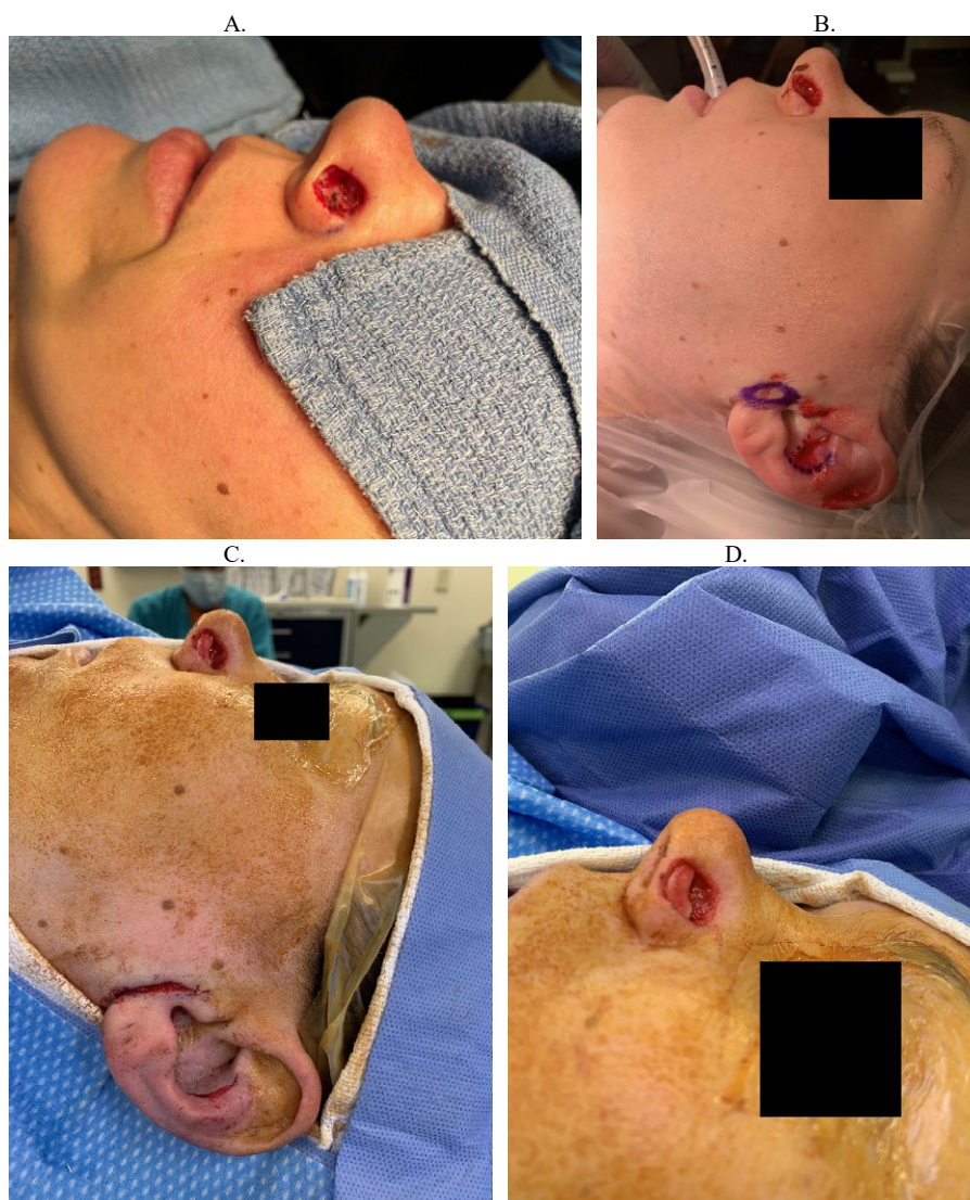
Figure 1: Reconstruction of nasal ala surgical defect post Mohs micrographic surgery. (A) Surgical defect on nasal ala. (B) Markings for grafts. (C) Surgical incisions for grafts. (D) Conchal cartilage graft in nasal ala.

The depicted 33-year-old female was referred with a 13x10 mm surgical defect immediately after Mohs micrographic surgery for excision of basal cell carcinoma. A conchal cartilage graft was used to span the width of the defect at the margin of the nostril. Soft tissue tunnels on either side of the defect were created to accommodate the medial and lateral ends of the graft. Finally, a pre-auricular full-thickness skin graft was used to provide excellent color match to the area. Due to the relatively small size of the defect, overlapping of the two free grafts does not typically affect healing. Our experience is consistent with long-term excellent results in preserving nasal valve function as well as acceptable aesthetic outcomes (Fig. 2).