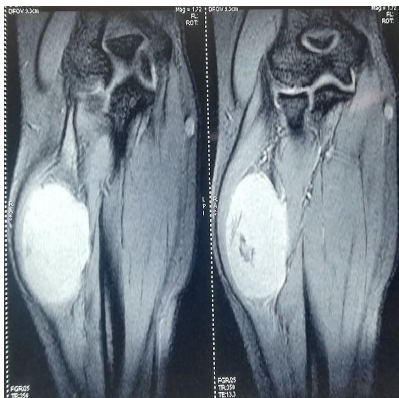
Figure 2: Magnetic Resonance Imaging coronal proton density-weighted images, showing a well-defined, heterogenous, predominantly hyperintense signals in lesion of 5.5 x 3.5 x 3 centimeter in posterolateral right forearm, dissecting the inter-muscular planes.