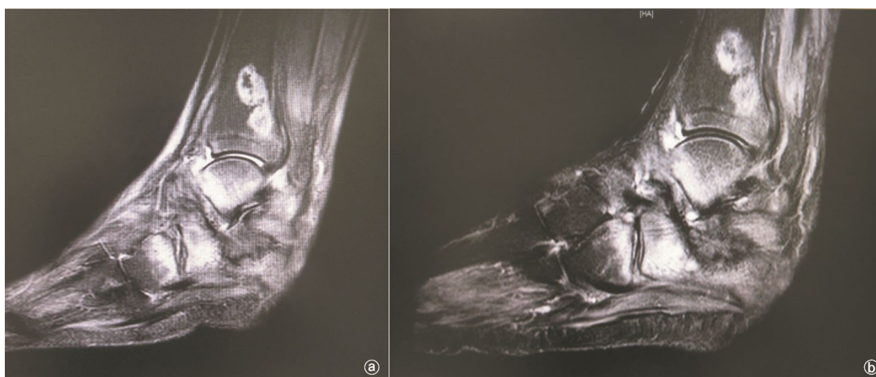
Figure 2: (a) Computed tomography angiography before Rheocarna treatment showing severe calcification and stenosis of the left below-knee arteries. (b) Computed tomography angiography after Rheocarna treatment showing improved blood flow

Meropenem hydrate was administered, and daily washing, ointment treatment, and debridement were performed as needed until the inflammation improved. Antibiotics were de-escalated as needed, and vacuum-assisted closure (VAC) ULTA ® (3M, Tokyo, Japan) was started one month after admission. Four weeks after starting VAC, granulation was somewhat raised and inflammation had improved; therefore, revascularization was reconsidered. However, anemia progressed, and close examination revealed multiple severe gastric ulcers. As a result,