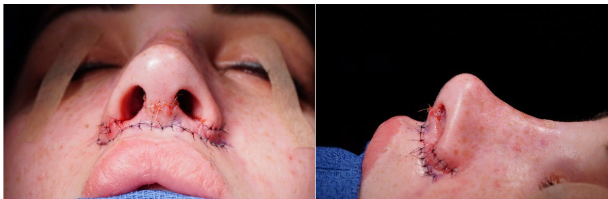
Figure 1: The incisions of open rhinoplasty, alar base reduction, and lip-lift.

To perform the lip-lift, the bullhorn design with excision of skin and Superficial Musculo Aponeurotic System (SMAS) was made. The amount of skin, that was excised, was customized based on the need to achieve over the center or more lift laterally of the lip. Also, alar reduction was performed in all patients. All of them involved complete through-and-through resection of alar wedge. The incisions of each cosmetic procedure are highlighted in detail in Figure 1.