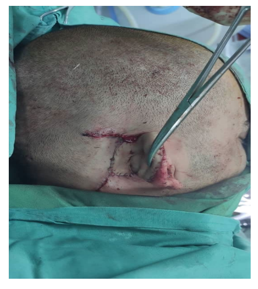
Figure 2: Right ear lesion was excised and the defect repaired with local advancement flap and full thickness skin graft.