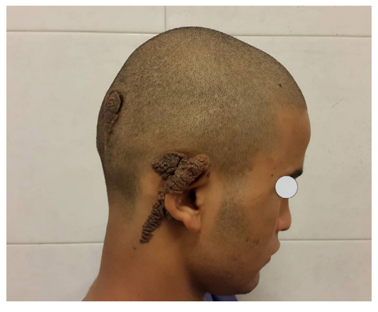
Figure 1: An 18-year-old boy with a Nevus like lesions on his scalp and right periauricular regions.