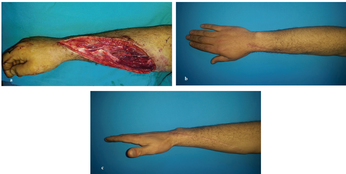
Figs. 6. a: A 37 years old male patient with both flexor and extensor tendon and superficial radial nerve injuries. b and c: are postoperative 14 months views, full extension could be seen in these figures.

strong tendon healing. Wu et al. discussed these methods and supported multistrand repairs more than double-strand repair. 8 The Savage six-strand repair 14 may give 81% good or excellent results. However, this complex technique has not become popular in the practice. Eight-strand repair has also been compared with Savage, two-strand Kessler and Tajima techniques and was found to have superior strength. 15