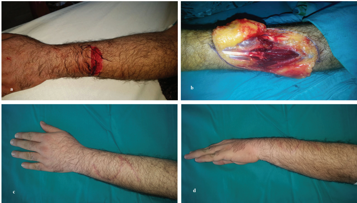
Figs. 5. a: A 27 years old male patient with multiple extensor tendon injury at the level of Forearm. b: is intraoperative. c and d: are postoperative 12 months view of the scar. Full extension of the fingers could be seen in these figures.