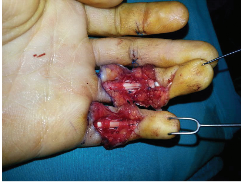
Fig. 2. A 35 years old male patient with 4th and 5th deep and superficial flexor tendon sharp injuries. It demonstrates intraoperative repair with modified Kessler technique. A2 pulleys were protected during surgery.