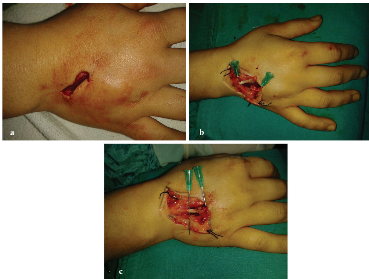
Figs. 4. a: A 39 years old female patient with extensor tendon injury. b: demonstrates the exploration of the proximal and distal ends of the tendon. c: was taken after repair.

all patients, 149 were male and 31 were female. Seventy isolated extensor tendon injuries, 60 isolated flexor tendon injuries, 30 multiple flexor tendon and major nerve injuries, 18 combined extensor and flexor tendon injuries, and 2 combined extensor, flexor and major nerve injuries that were treated in the center were enrolled. There was not any deep radial nerve injury in the series.