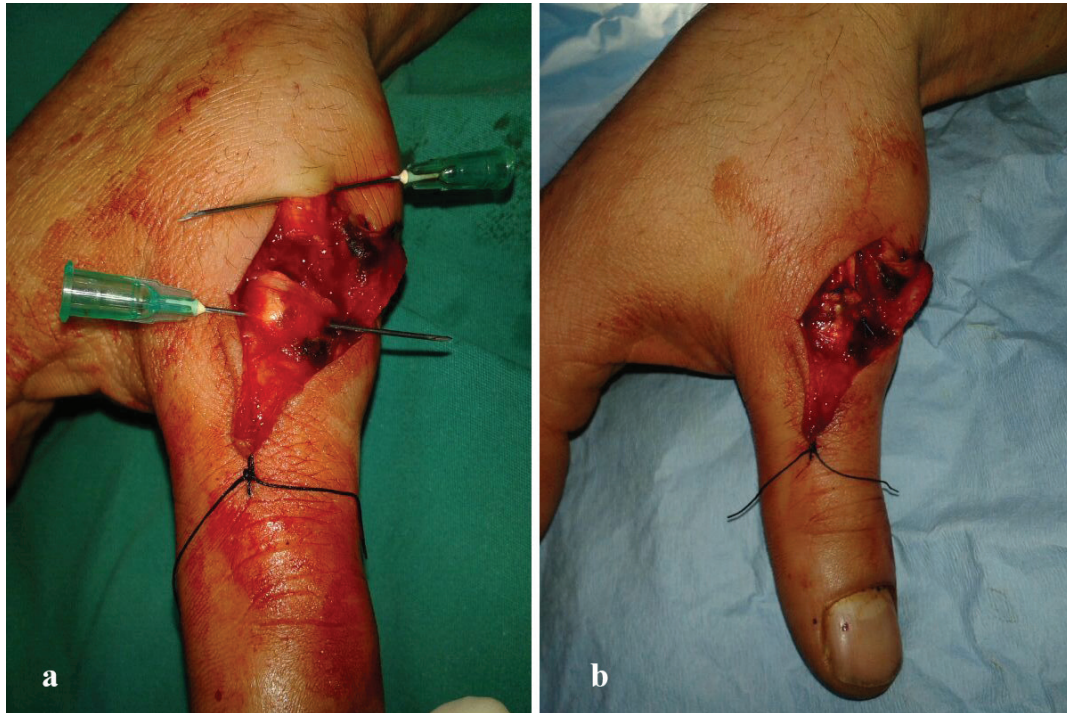
Figs. 3. a: A 25 years old male patient with extensor pollicis longus injury. b: was taken after surgical repair.

by a physiotherapist at the 3rd day. If patient was conscious, these processes were taken 3 to 5 days forward. Splint was taken at the end of the first month. In extensor tendon injuries, early passive extension was started at the 3rd day and replaced with active extension at the day of 7. Interphalangeal and metacarpophalangeal joint flexions were offered at the 20th day. At the end of one month splint was taken from the patient.