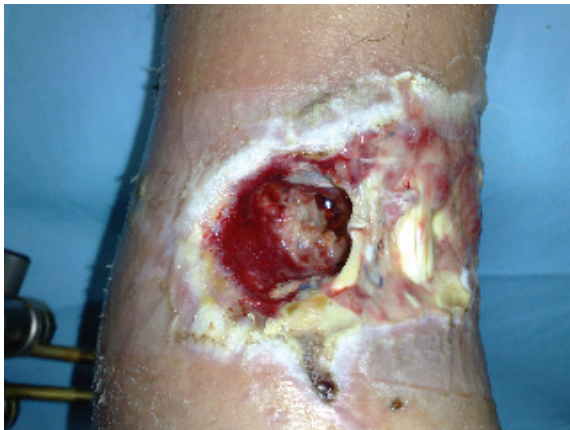
Fig. 1: Post-traumatic wound before the treatment.