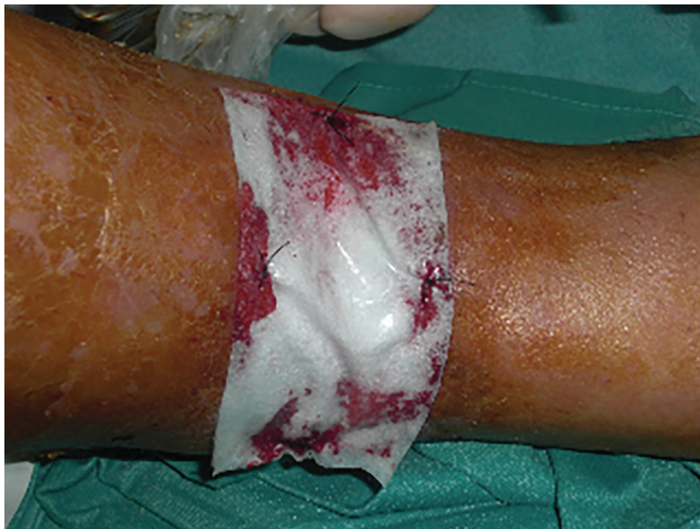
Fig. 4: Intra-operative view. Application of HA on PRP.

the surgical treatment there was full recovery (Figure 5). After that the patient applied emollient, moisturizing and firming creams and a knee-high elastic compression.