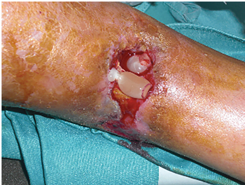
Fig. 3: Intra-operative view. PRP gel application.