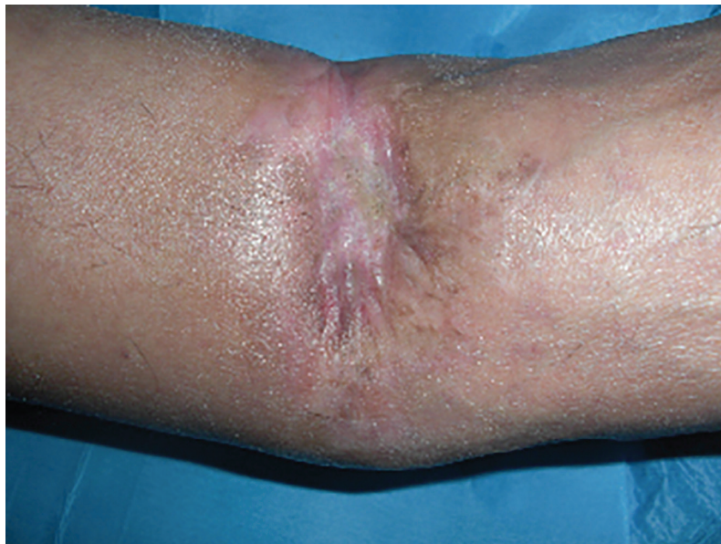
Fig. 6: Postoperative view after 8 weeks.

fibroblasts, endothelial cells, macrophages and platelets. The migration, infiltration, proliferation and differentiation of these cells will culminate in an inflammatory response, the formation of new tissue and ultimately wound closure. This complex process is executed and regulated by an equally complex signalling network involving numerous growth factors, cytokines and chemokines. Particular relevance is the epidermal growth factor (EGF) family, transforming growth factor beta (TGF-beta) family, fibroblast growth factor (FGF) family, vascular endothelial growth factor (VEGF), granulocyte macrophage colony stimulating factor (GM-CSF), platelet-derived growth factor (PDGF), connective tissue growth factor (CTGF), interleukin (IL) family, and tumour necrosis factor-alpha family. 5