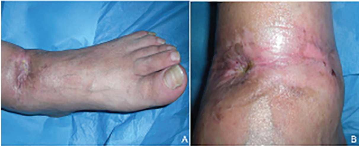
Fig. 5: Postoperative view after 45 days: A: anterior view, B: antero-medial view.