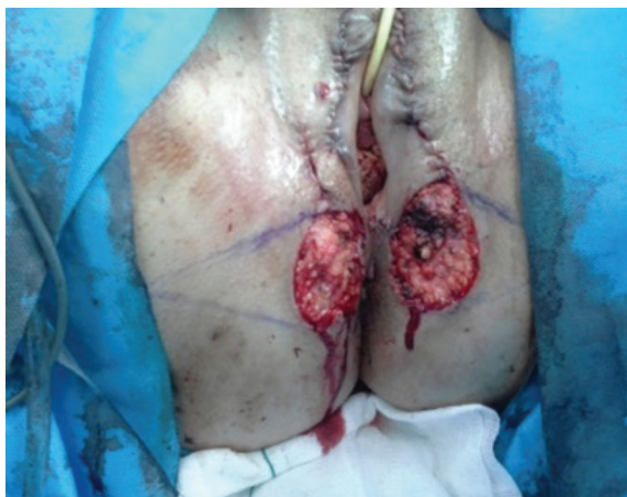
Fig. 2: Patient during the surgical procedure.