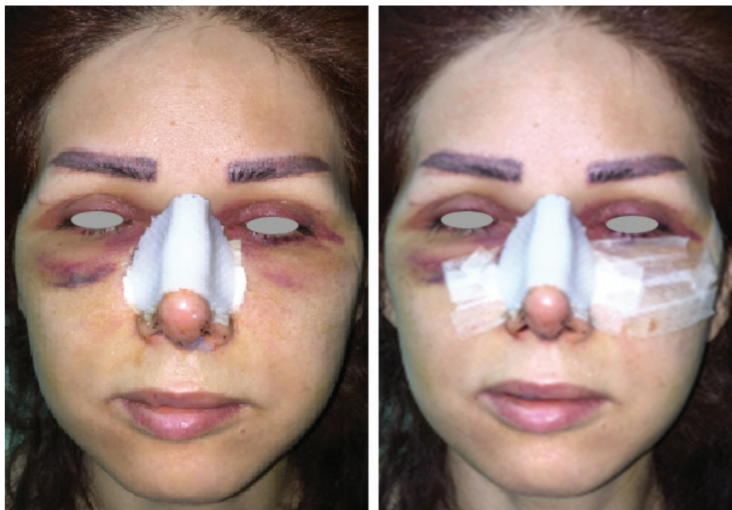
Fig. 2: Success of steri-strip tape for controlling post rhinoplasty ecchymosis.

as well as some herbal extracts. 15-19 Some also used hypotensive drugs during head and neck surgeries 20,21 which are not systematically offensive to be used only to reduce ecchymosis.