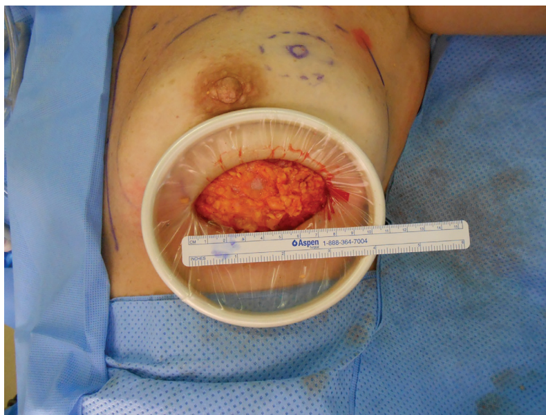
Fig. 5: Nipple sparing mastectomy with incision in the infra mammary sulcus.

III interpectoral lymphadenectomy in 1. Among 23 patients who received the conservative surgery, the tumor was in the supero lateral quadrant in 8, the infero medial quadrant in 2, the supero medial quadrant in 4, the infero lateral quadrant in 2, the intersection of superior quadrants in 3, the intersection of inferior quadrants in 1, the intersection of medial quadrants in 1, and in the lateral quadrants in 2 (Figure 1).