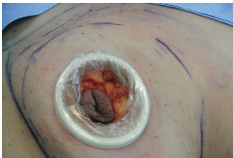
Fig. 4: Skin sparing mastectomy.

We performed 31 surgical procedures using the single-incision technique: prime incision and modified moving window. There were 30 patients with primary breast cancer diagnosis stages I and II and 1 with loco-regional recurrence. We performed conservative surgery in 23, adenectomies in 7, and an axillary incision for level