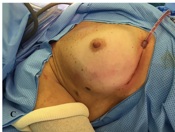
Fig. 2: Inframammary sulcus approach. A: conservative surgery tumor on the intersection of lateral quadrants. B: Sentinel lymph node dissection. C: Final aspect.