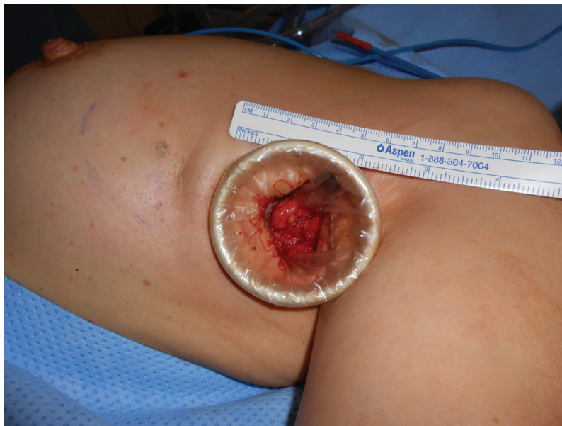
Fig. 3: Axillary incision.

from the lower musculature. After having the breast totally superficially and deeply detached, we delimited the superior, lateral and medial edges and removed it. Through the cavity created with mammary gland removal and using retractors with light and smoke evaporator, the axillary region was approached.