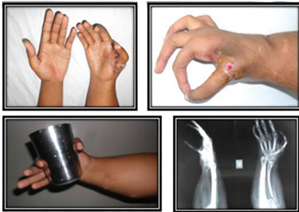
Fig. 3: Post operative clinical, radiological and functional status