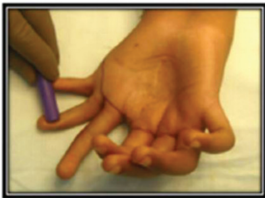
Fig. 2: Intra operative markings.

So, dorsal muscle with periosteal strip hitched to radial lateral band and palmar muscle mass attached to ulnar lateral bands. The third ray was abducted, pronated in desired position to serve as thumb function and fixed with K wires. The extra skin of fillet flaps was used for deepening of first web space. On follow up satisfactory hand function was achieved (Figure 3) which is supported by DASH (Disability of the arm, shoulder and hand) score. Total DASH score is 12.93.