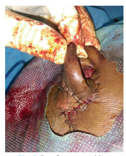
Fig. 5: Post flap transposition.

anatomical repair of the pinna as well as to provide acceptable cosmesis at the same time. Various techniques and methods have been described by authors highlighting the successful repair of traumatic injuries of pinna. Singh et al. described the use of doubled-over Limberg flap in reconstruction of ear lobule in 6 patients.<sup>3</sup> Chattopadhyay et al. demonstrated the Gavello flap technique from post auricular mastoid region in ear lobule reconstruction in 3 patients.<sup>4</sup> In the large volume study of 105 patients requiring post traumatic reconstruction by Kolodzynski et al.,1 apart from the use of costal cartilage for reconstruction in 53 patients, the skin cover for the pinna was provided using skin pockets in 53 patients, post auricular flap in 21 patients, tissue expansion in 12 and temporoparietal fascia flap in 12 patients.