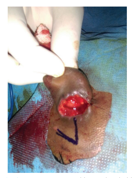
Fig. 3: Raw area prepared into a rhomboid.

The traumatic external ear poses a challenge to the reconstructive surgeon. The protruded configuration and the presence of cartilage sandwiched between the skin makes it vulnerable to traumatic injuries and post traumatic infections. The usual mode of injuries are bite injuries, injuries in sportspersons, road traffic