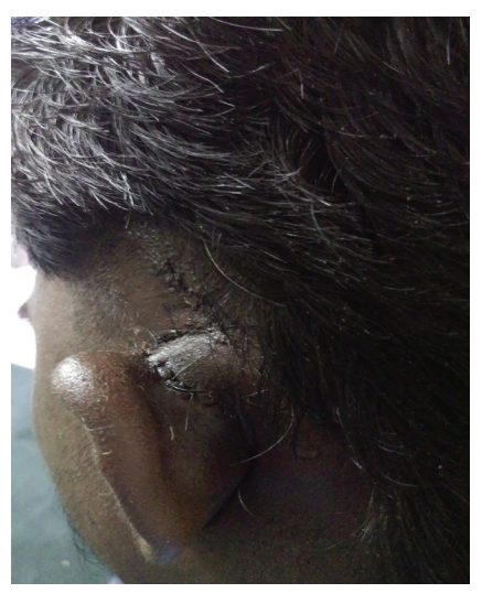
Fig. 6: Healed wound after 1 week with good cosmesis.

The versatile rhomboid flap was first described by Professor Limberg in 1928.<sup>10</sup> It is a parallelogram with two angles of 120° and two of 60° which can be modified as per the size of the