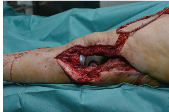
Fig. 1: Large lateral defect with hardware exposure.

with a lateral gastrocnemius flap, however, the surrounding area was highly scarred, and the gastrocnemius muscle was found to be very atrophic and no suitable to fit the large defect. Figure 1 shows no other local flaps to be large enough to cover the whole defect, so we opted for a free flap.