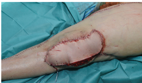
Fig. 3: Latissimus dorsi flap after inset.

closed primarily. Intraoperatively, no incidences occurred and the flap appeared well perfused. The patient was extubated and transferred to the recovery room in stable condition with standard clinical monitoring. Tissue oximetry system (INVOS CO.) was used 72 hours after the surgery. Three drainages were left, two of them in lower limb placed in lateral knee and lateral hip and one in donor area of the flap. Drainages were retained until output was less than 30 ml per day.