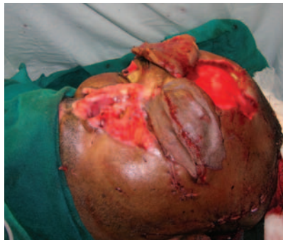
Fig. 4: Prefabricated forehead flap.