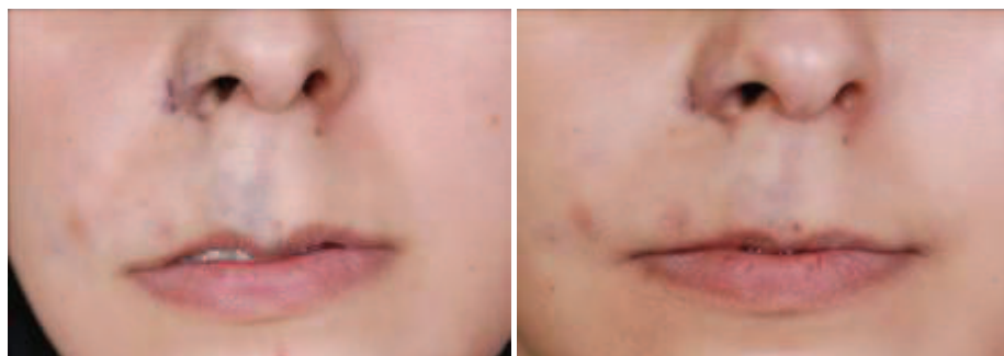
Fig. 4: A 26 years old lady with venous malformation of right upper lip and alar base. She received 3 injections of the combination of bleomycin, triamcinolone and epinephrine with 2 months interval (Left) result after 6 months (Right).