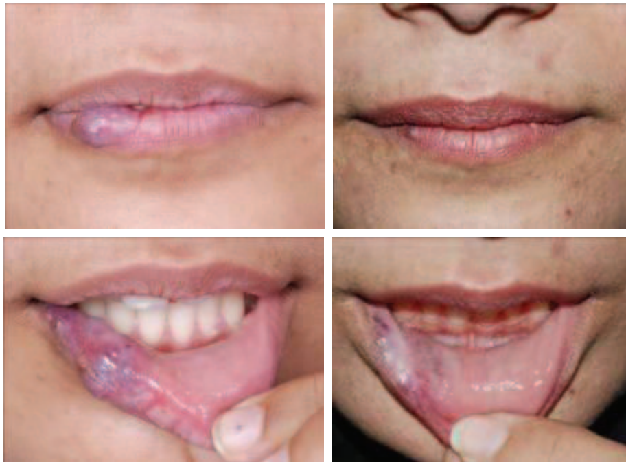
Fig. 5: A 33 years old lady with small venous malformation of lip vermilion (left). She received 3 injections of the combination of bleomycin, triamcinolone and epinephrine with 3 months intervals. After 6 months the result is as shown (Right).