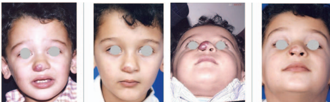
Fig. 2: A 3 years old boy with nasal tip straw berry cap malformation (left). The patient received 2 injections of the combination of bleomycin, triamcinolone and epinephrine with 3 months interval. The outcome after 1 year (Right).