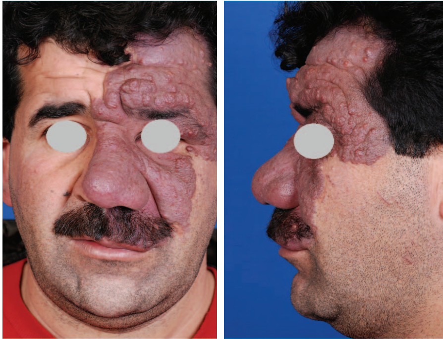
Fig. 7: Case of port wine stain without any response to 3 injections of combination therapy.

successfully treated hemangiomas while injected intralesionally, with a success rate of 87% and venous malformations with a success rate of 84%. 10 This drug has low toxicity 15 and it seems that bleomycin is a good treatment modality for vascular anomalies, but it has some complications (mainly localized) too. Muir et al. reported flu-like symptoms, ulceration, cellulitis and partial, temporary hair loss in some patients. 15 Luce has reported pulmonary fibrosis in some oncologic patients who went under treatment with high intravenous dose of bleomycin 16 in 1997. A study was performed that used bleomycin for treatment of painful, massive hemangiomas in children and reported that all cases relieved from pain and had a substantial reduction in the mass of lesion. 17 Omidvari et al. assessed the effectiveness of intralesional injection of bleomycin with two weeks intervals for 4 to 6 times in treatment of complicated hemangiomas. They observed the maximum of lesion regression occurred in the first three months of treatment. They had a follow-up of 6 months and reported no recurrence or systemic and local complications. They concluded that bleomycin is a good therapeutic modality for treatment of hemangiomas especially in painful or massive lesions. 11